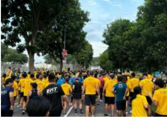
Volunteers participated in YR Run 2024

CCS volunteers also participated in Yellow Ribbon Run 2024, which coincided with the Yellow Ribbon Project's (YRP) 20th anniversary celebrations. YRP aims to create awareness of second chances and inspire community action to support the rehabilitation and reintegration of inmates and ex-offenders, working towards an inclusive society.