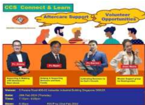
Presenters for February's C&L

C&L aims to bring together volunteers helping desistors to share their own learning experiences with one another. It also provides an opportunity for volunteers to network with each other. CCS held two C&L events in February and August with more than 80 participants joining the event.