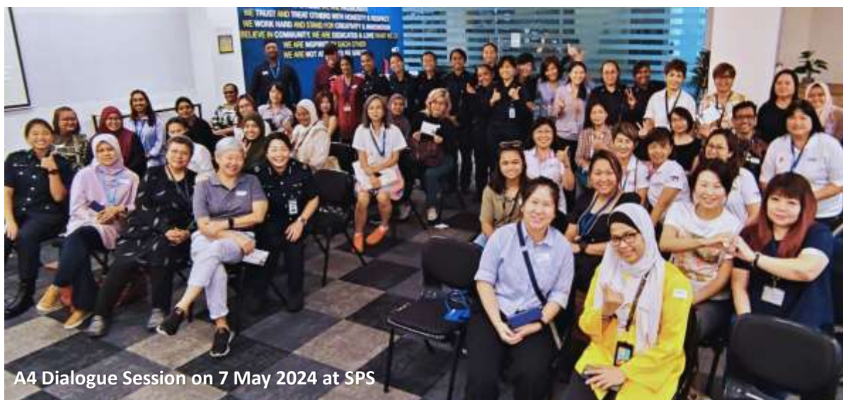
A4 Dialogue Session on 7 May 2024 at SPS

As part of A4's continuous effort to engage volunteers, the superintendent of A4 invited active volunteers serving in Cluster A4 to SPS's Dialogue & Sharing Session on 7 May 2024, held at SPS Headquarters. Volunteers had a good sharing led by SPS Correctional Rehabilitation Specialists (CRS) on Gender Responsive Approach in Handling Female Offenders. CRS are SPS counsellors working closely with the women officers at Institution A4 on gender responsive initiatives for effective assessment and interventions. SPS also invited different social service agencies to share their work, to create awareness and explore possible collaboration.