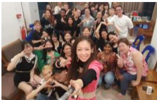
A4 Women Support Group

Faith fellowship continued with desistors gathering on a bi-weekly basis at Rejoice Community Baptist Church, held every second and fourth Thursday of the month.