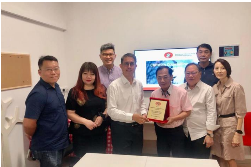
MOS Muhammad Faishal Ibrahim visited CCS Office for acknowledgment.

In June 2023, Minister of State for National Development, Muhammad Faishal Ibrahim visited CCS office to acknowledge CCS for its contributions over the years in helping ex-offenders.