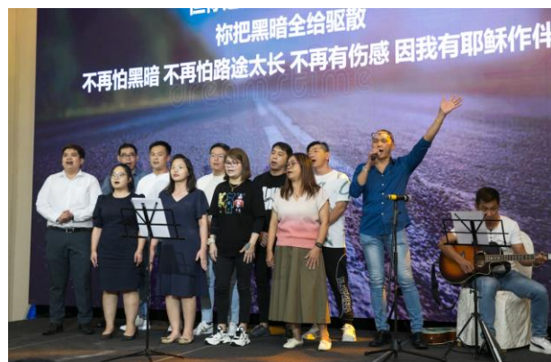
Overcomers Song Presentation