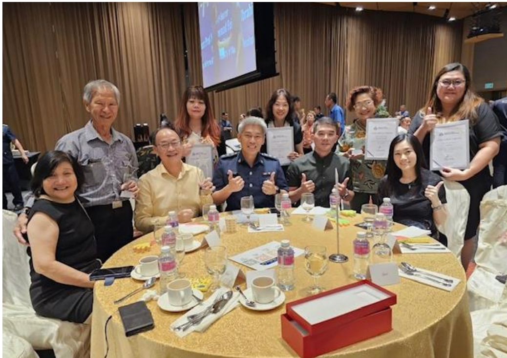
Some CCS Volunteers at SPS Long Service Award Ceremony