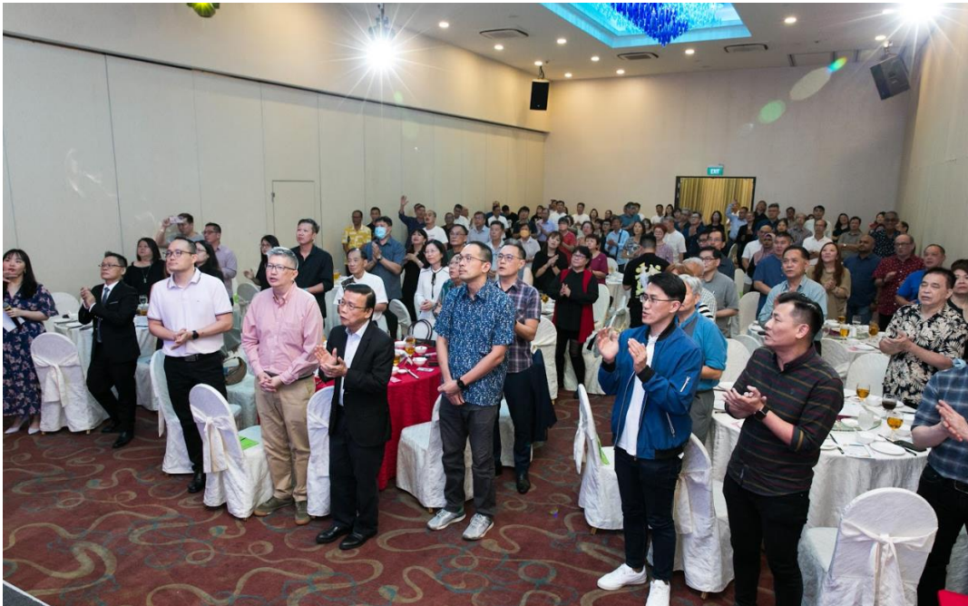
CCS Appreciation Dinner at Safra Toa Payoh, Jubilee Restaurant in 2023