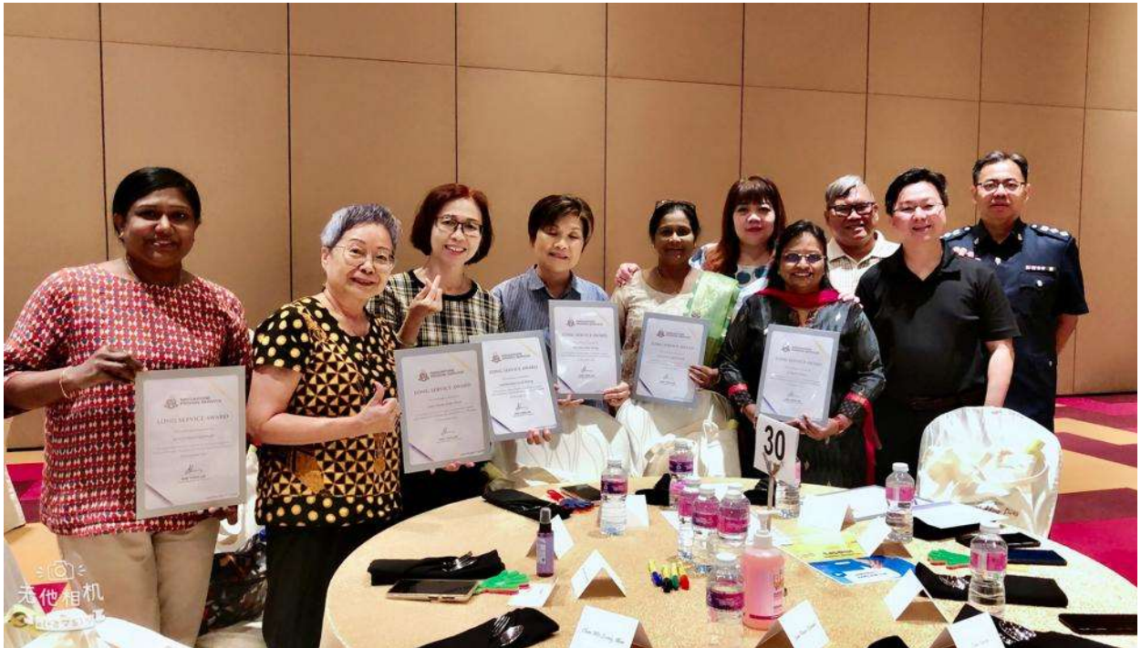
Singapore Prison Long Service Award Ceremony for Volunteers

CCS volunteers were also engaged and recruited for upcoming initiatives by Singapore Prison, namely the Volunteer Case Officer program and Desistor Network project.